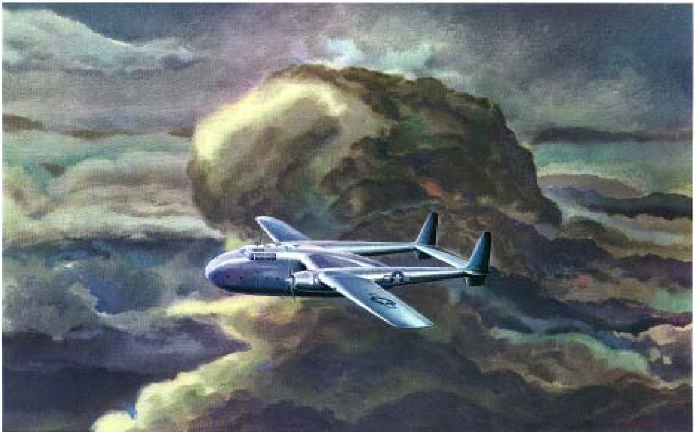
The Fairchild Boxcar