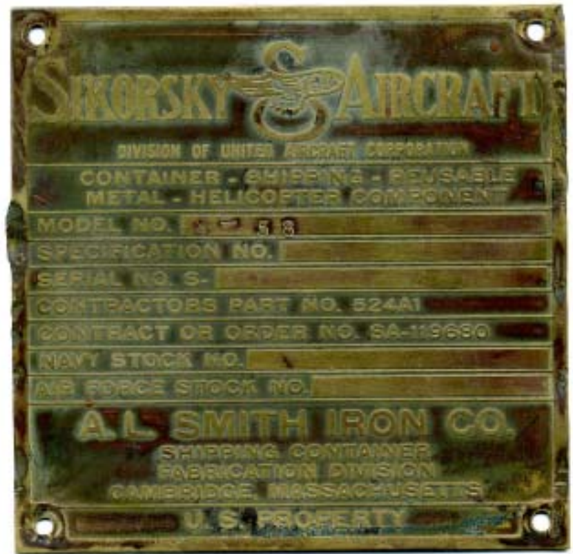
Not sure if I put this in before - A data plate from an H-34 shipping crate