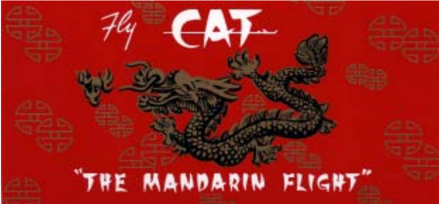
Reproduction CAT label found on eBay