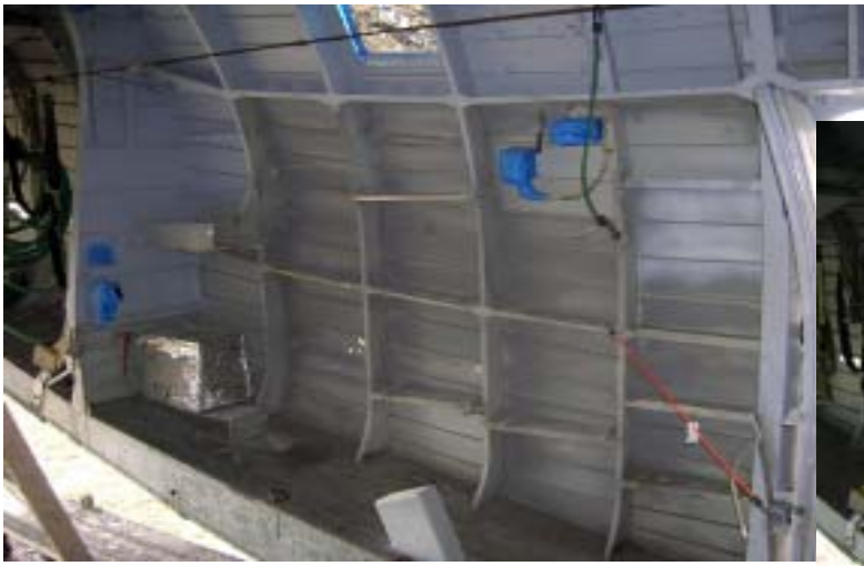
Port Side Before