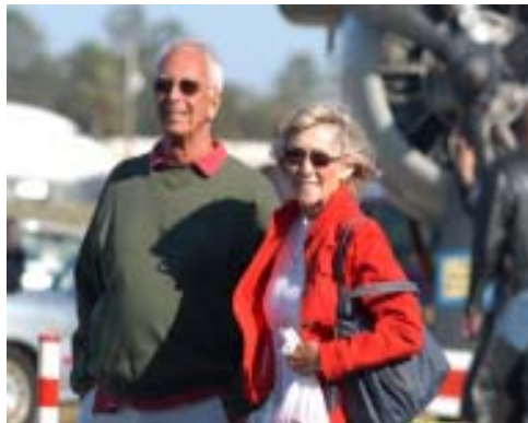
The Blooms enjoying the beautiful weather