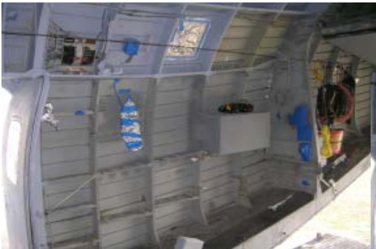
Starboard Side Before