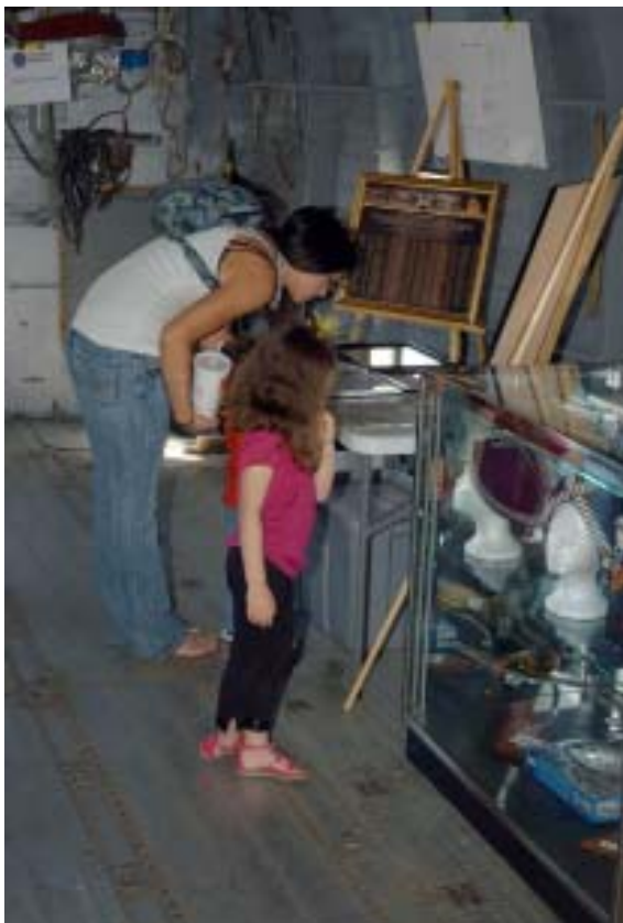
Vistors to 674