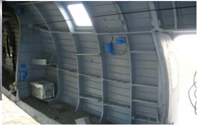
Port Side After