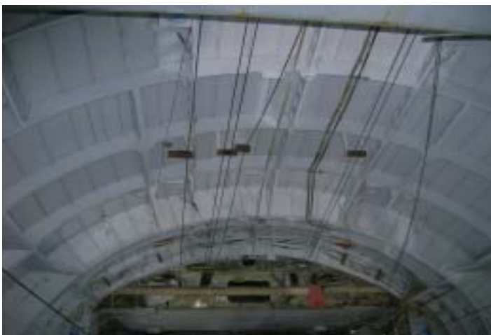
Overhead Bulkhead After

These images were taken prior to the airshow