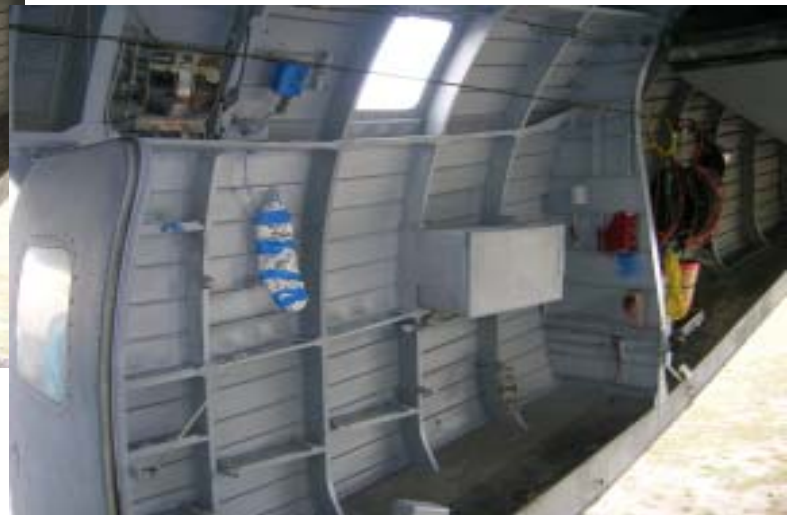
Starboard Side After