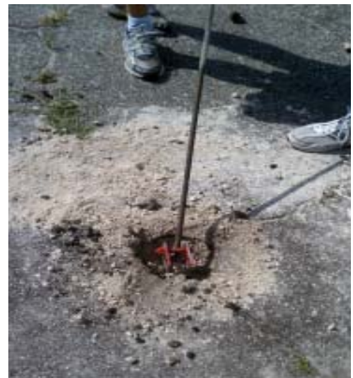
Finished tie down!