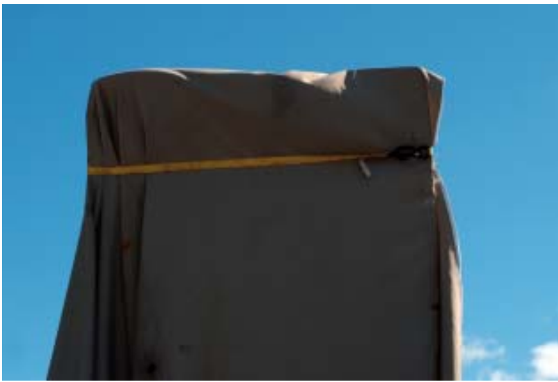
Tops of the props! - Covered again!