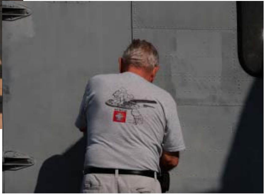
Cal making sure 674 is locked up tight!