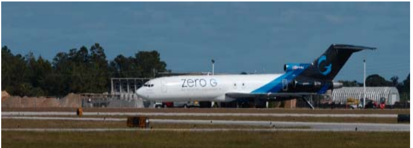
Zero G! Let me tell you she takes every bit of runway that is there!