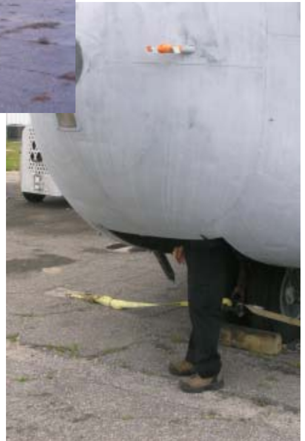
For a brief time Fairchild experimented with various forms of landing gear. Some just never lived up to expectations.