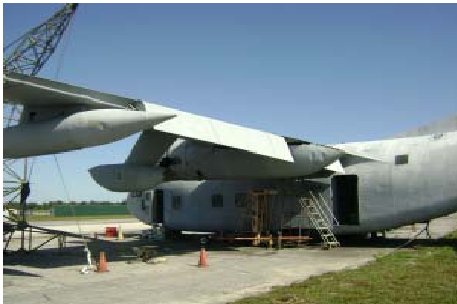
Flaps full down