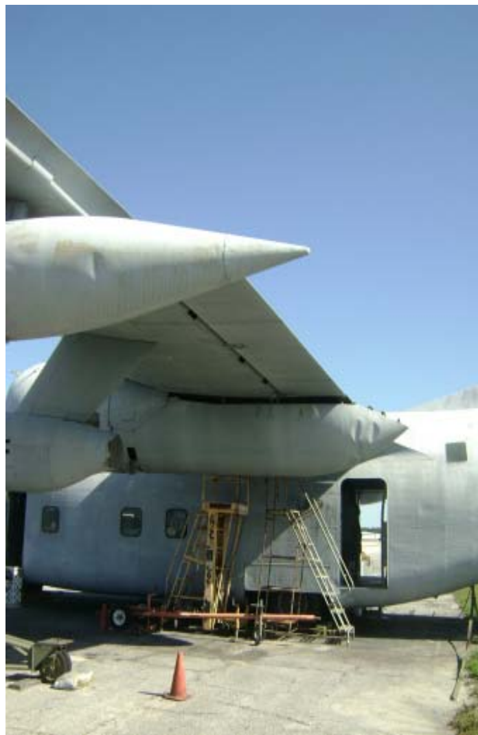
Flaps back to normal