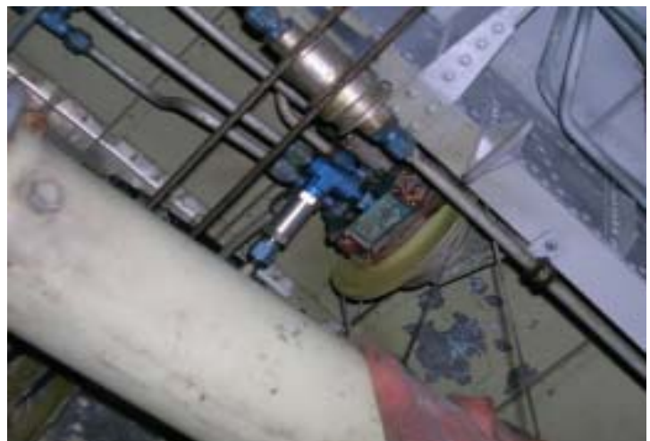
Looking up at the leaky flap control valve. We think it was rebuilt once with the wrong o-rings. That could be the reason for the new leaks.