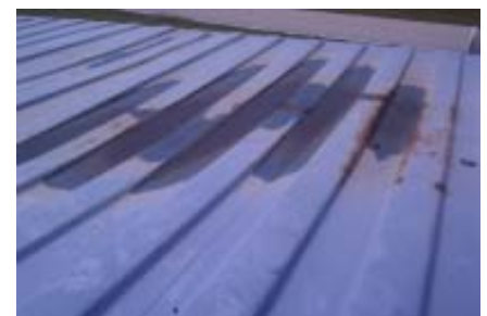
Top of the leaky con-ex box before the patchwork.