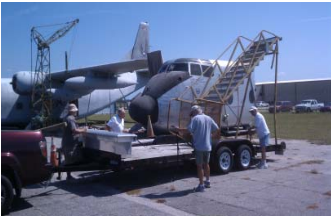
Getting ready to unload stairs from my trailer. It was pretty close getting under some of the power lines around the airport.