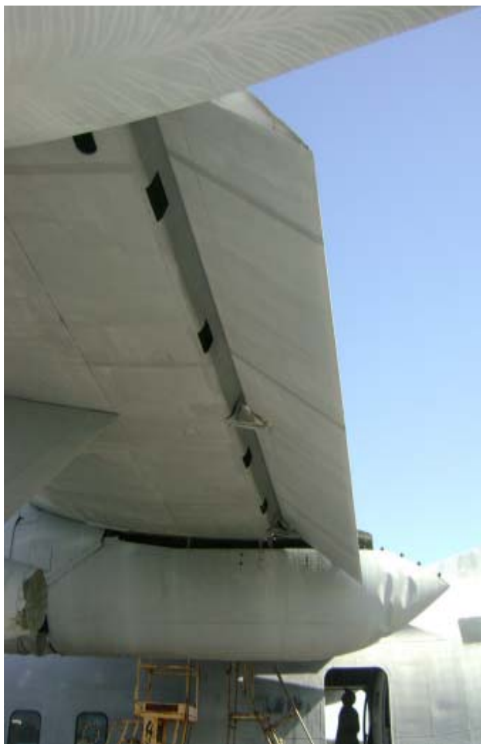
Flaps on their way up