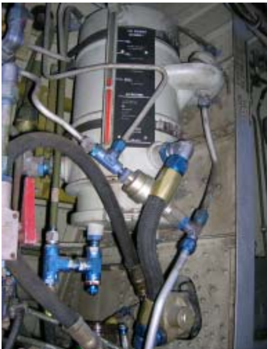
Hydraulic system reservoir.